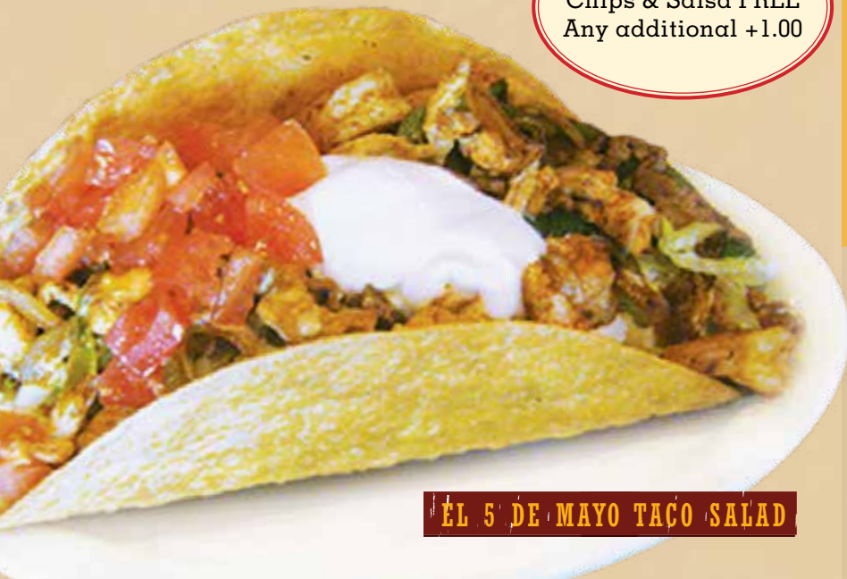
EL 5 DE MAYO TACO SALAD

Ten grilled marinated shrimp over lettuce with cheese, onions, tomatoes and bell peppers 13.99