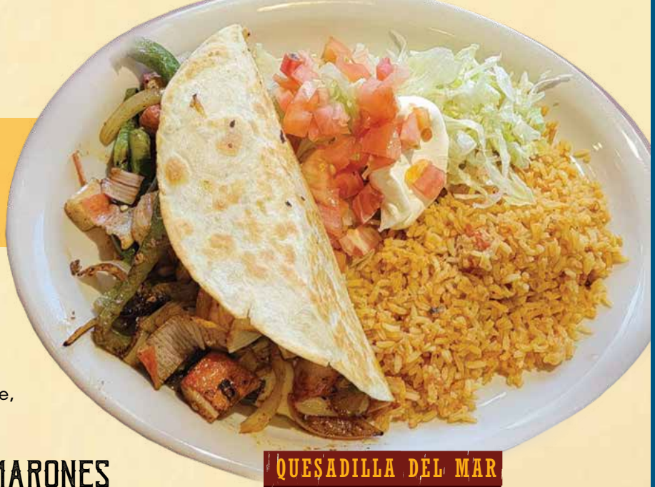
QUESADILLA DEL MAR

Filled with grilled chicken, Mexican sausage and onions. Served with guacamole salad and rice 16.99