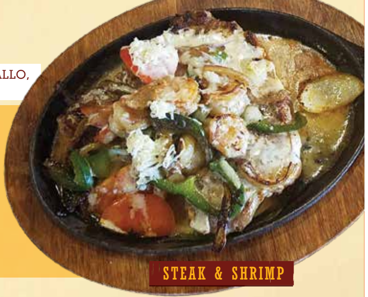
STEAK & SHRIMP

A marinated 12-oz. T-bone steak* and shrimp sizzled on the grill with onions, bell peppers and tomatoes. Served with tomatoes, shredded cheese, rice and warm tortillas 24.99