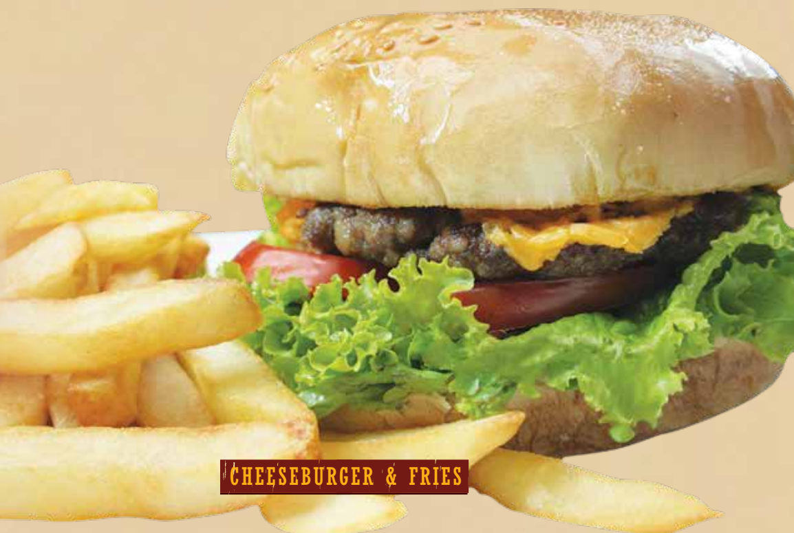
CHEESEBURGER & FRIES