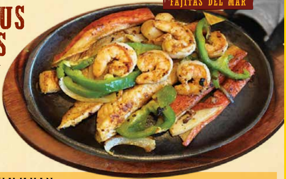
FAJITAS DEL MAR

SALAD SERVED UPON REQUEST: LETTUCE, PICO DE GALLO & SOUR CREAM