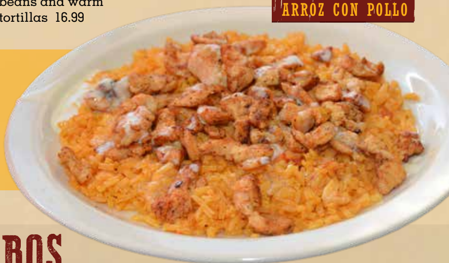
ARROZ CON POLLO

Grilled chicken breast smothered with cheese sauce and garnished with lettuce, sour cream and pico de gallo. Includes rice, beans and flour tortillas 14.99