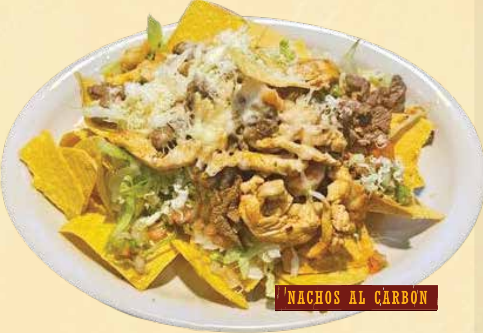
NACHOS AL CARBON