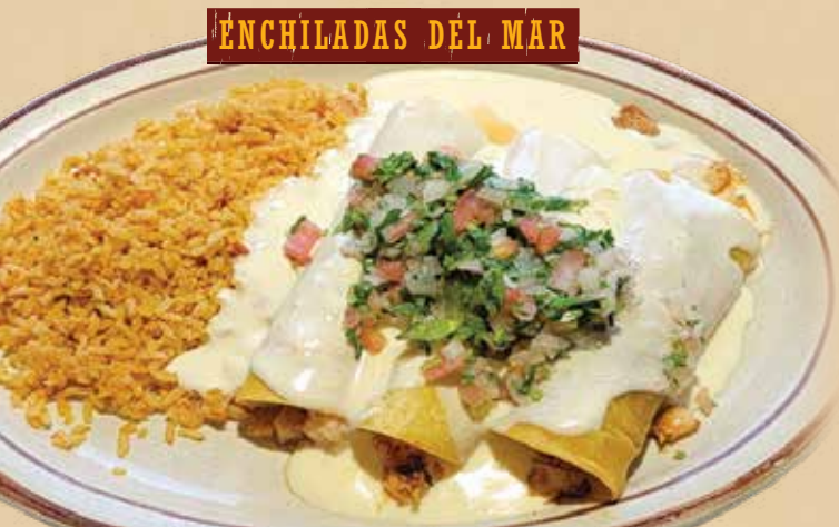
ENCHILADAS DEL MAR

Three tortillas filled with crab, tilapia and shrimp topped with cheese sauce served with rice 15.99