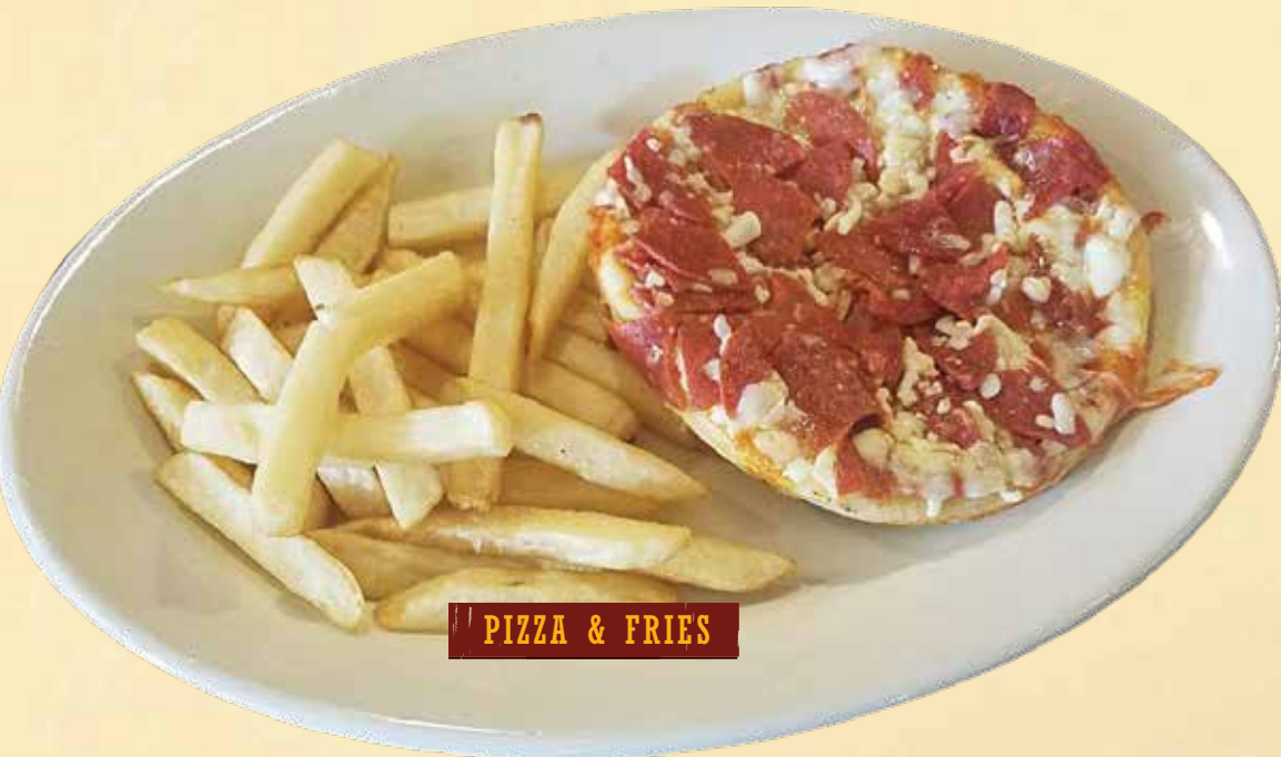
PIZZA & FRIES