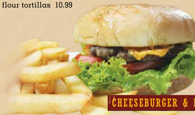
CHEESEBURGER & FRIES

*Consuming raw or undercooked meats, poultry, seafood, shellfish or eggs may increase your risk of foodborne illness, especially if you have a medical condition