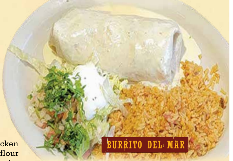
BURRITO DEL MAR

Stuffed with grilled chicken, chorizo, steak*, shrimp, onions and pineapple topped with cheese sauce. Served with rice 14.99