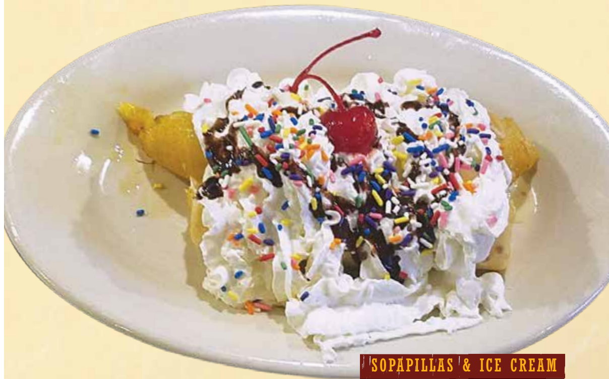
SOPAPILLAS & ICE CREAM