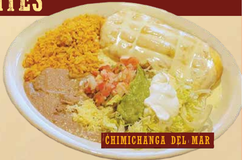
CHIMICHANGA DEL MAR

Tender pork simmered in savory green salsa. Served with rice, beans, guacamole and tortillas 14.99